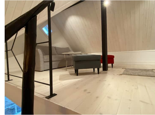
Sofa bed #1