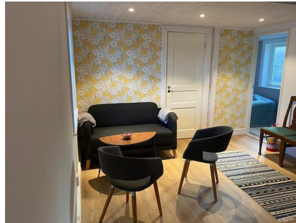
Sofa bed #2