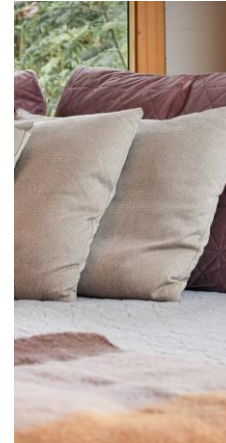
Sofa bed – 2 single beds